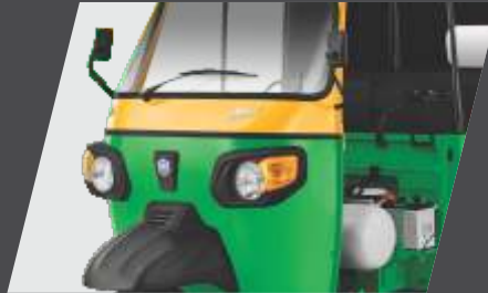
Attractive design and looks