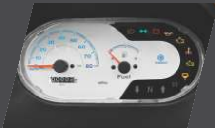
Advance information display