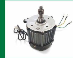
Powerful BLDC Motor