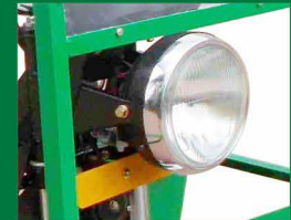
Halogen Head Lamp