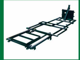
Tubular Section Chassis