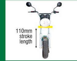
Telescopic Front Suspension