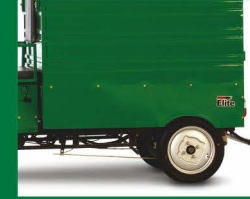
Wheels interchange with each other