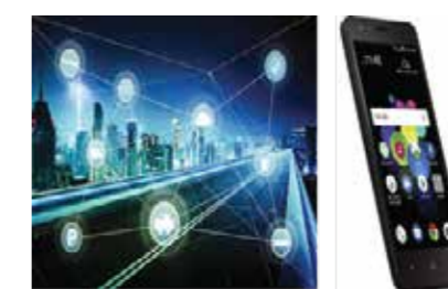
Fleet Edge - Connected vehicles for optimum Operations