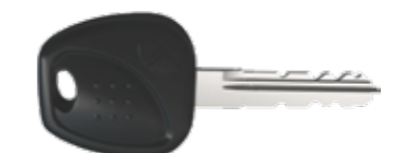
Single Key Operation

*Images are used for reference purpose only