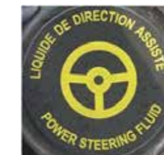
Increased & synchronized service intervals