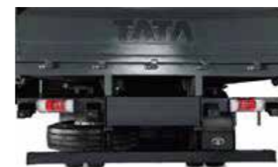
Reverse Parking Assistance System