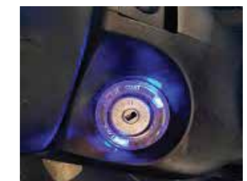
White Illumination Facia and Ignition Switches for Driver guidance in Night