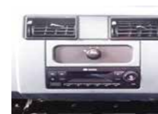
Music System and High speed USB Charger